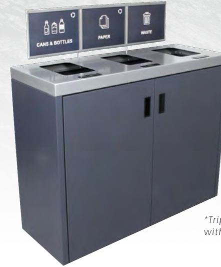
*Triple shown with signframe