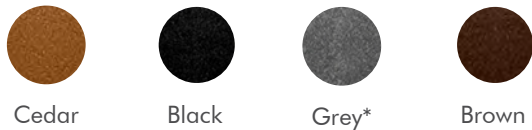
Cedar Black Grey* Brown

*Assembled and ready to ship in small quantities.